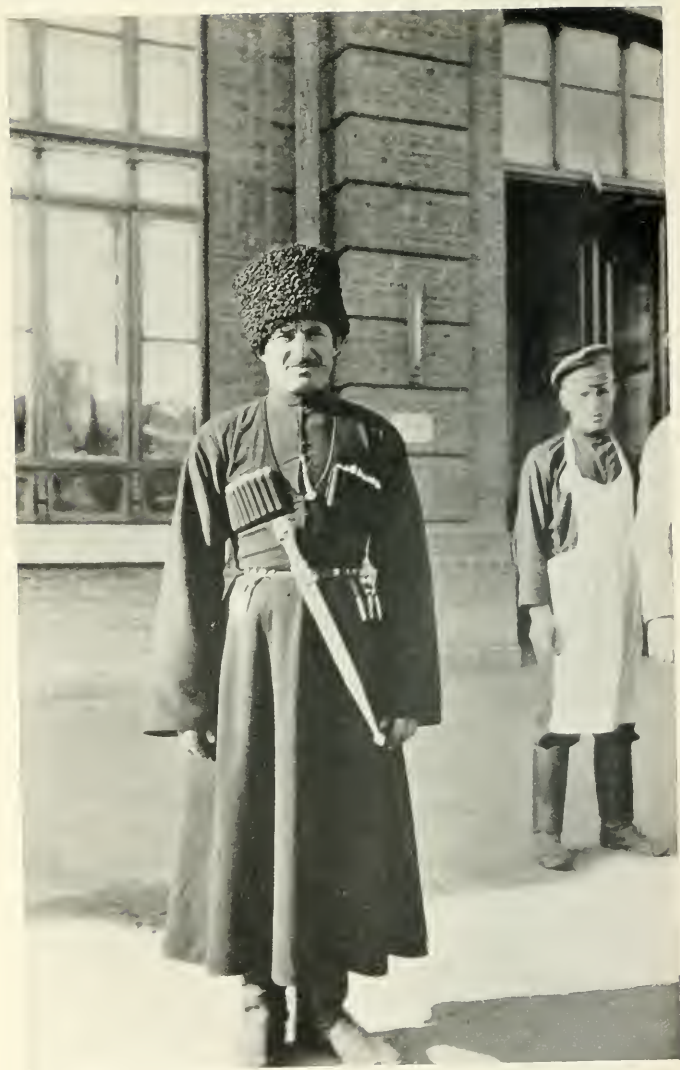
RUSSIAN GUARD AT VLADIKAVKAS